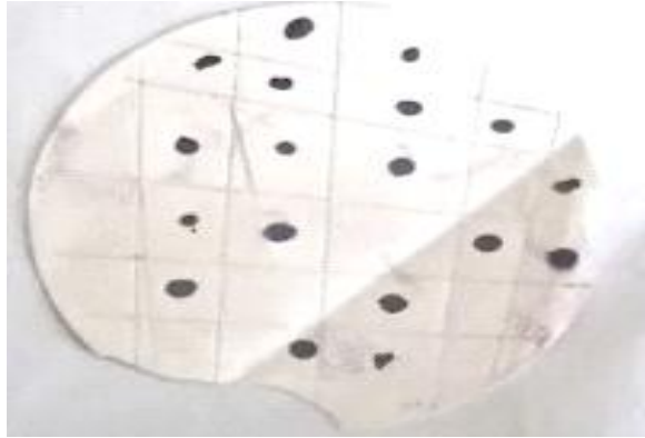
Figure1. Results of DBH (black spots indicated positive amplification of LSDV in clinical samples and local reference strain and SPPV DNA