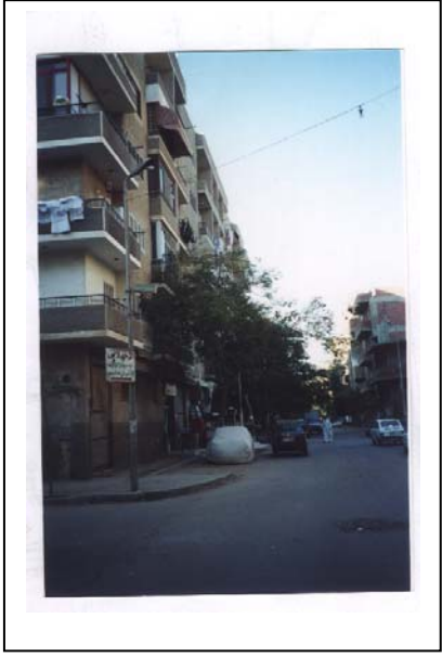
( 12 20 )